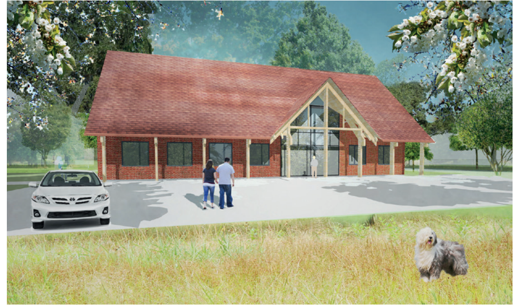
Offices for the 21st Century: An artist's impression of the proposed new council offices to be sited at Ketts Park

Plans for the whole project are on display until 6 April in the council offices, and may be seen on the Town Council website www.wymondhamtc.norfolkparishes.gov.uk The council would very much appreciate comments from the Wymondham community.